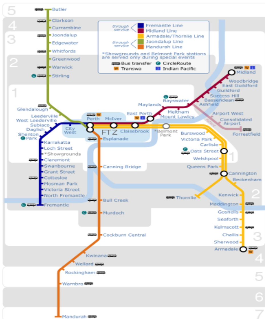
Extracted map 7 June 2019 from the Transperth website at: http://en.wikipedia.org/wiki/File:TransperthRailwayMap.svg